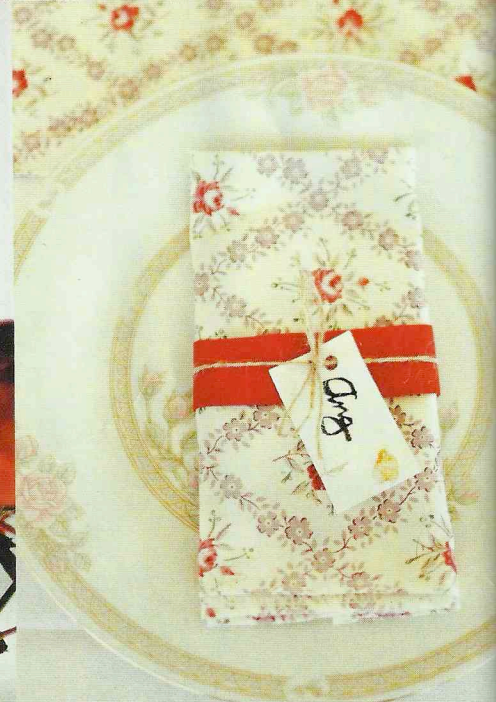
"HAND-WRITTEN place cards added a personal touch."