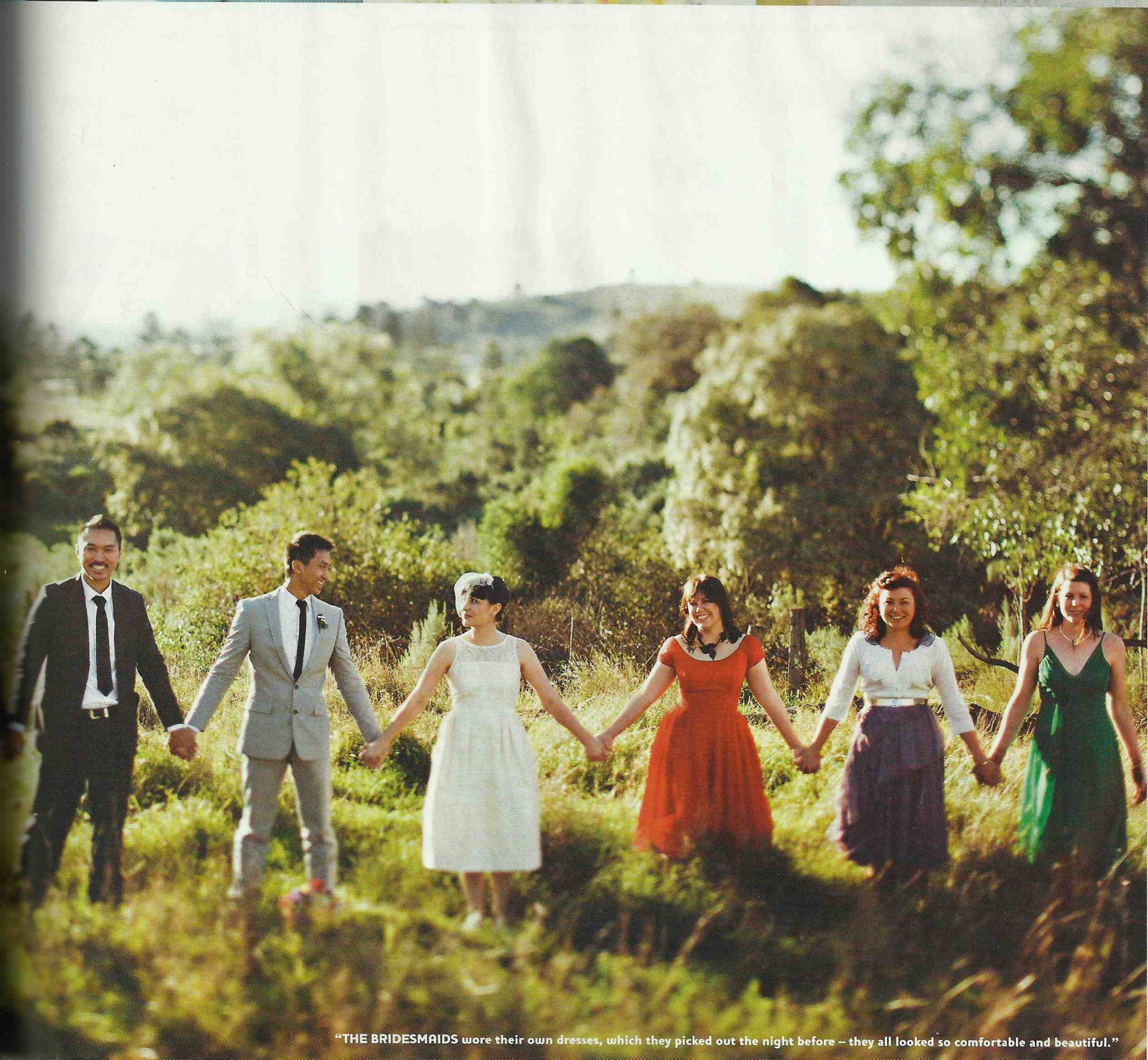
"THE BRIDESMAIDS wore their own dresses, which they picked out the night before – they all looked so comfortable and beautiful."