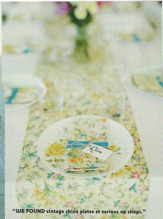
"WE FOUND vintage china plates at various op shops."