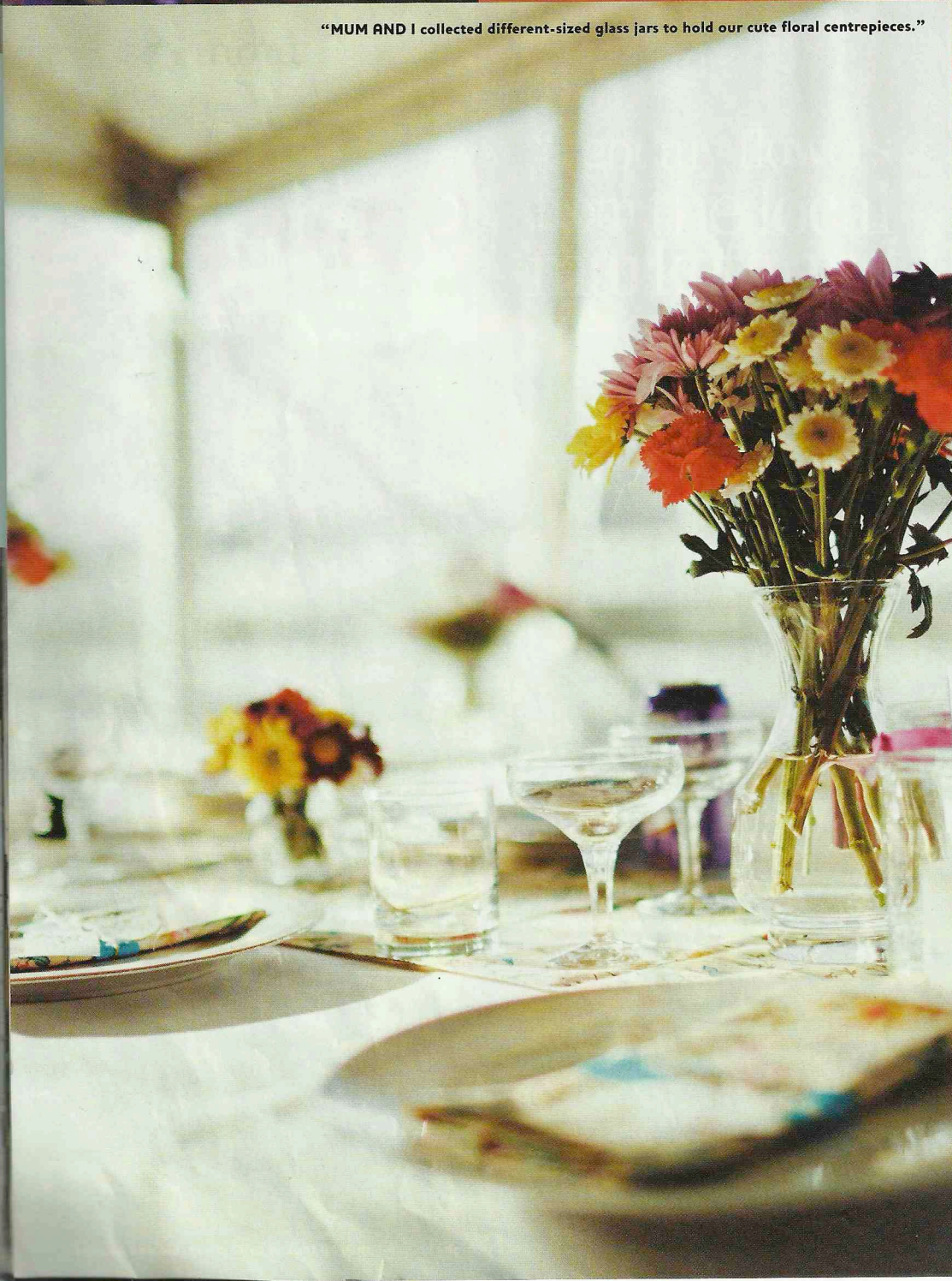
"MUM AND I collected different-sized glass jars to hold our cute floral centrepieces."