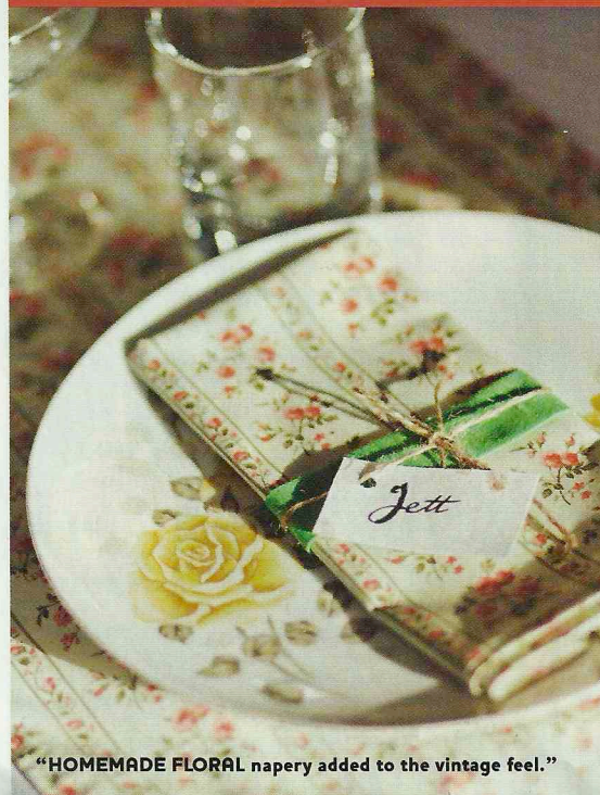
"HOMEMADE FLORAL napery added to the vintage feel."

"I got my flowers from the local markets and chose from what was there on the day"