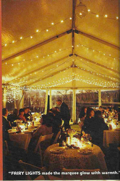
"FAIRY LIGHTS made the marquee glow with warmth."

Chocolate mud cake; carrot cake; white chocolate and Tim Tam party pops; marble sponge cake; vanilla cupcakes; jam slice; apricot slice