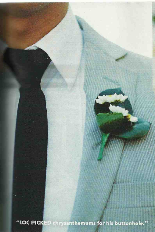
"LOC PICKED chrysanthemums for his buttonhole."