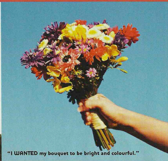
"I WANTED my bouquet to be bright and colourful."