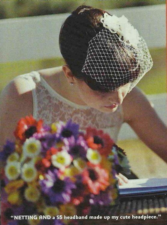
"NETTING AND a $5 headband made up my cute headpiece."