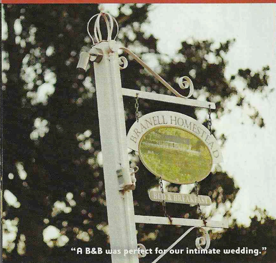
"A B&B was perfect for our intimate wedding."

An endearing mix of hand-picked objects is at the heart of this dreamy wedding