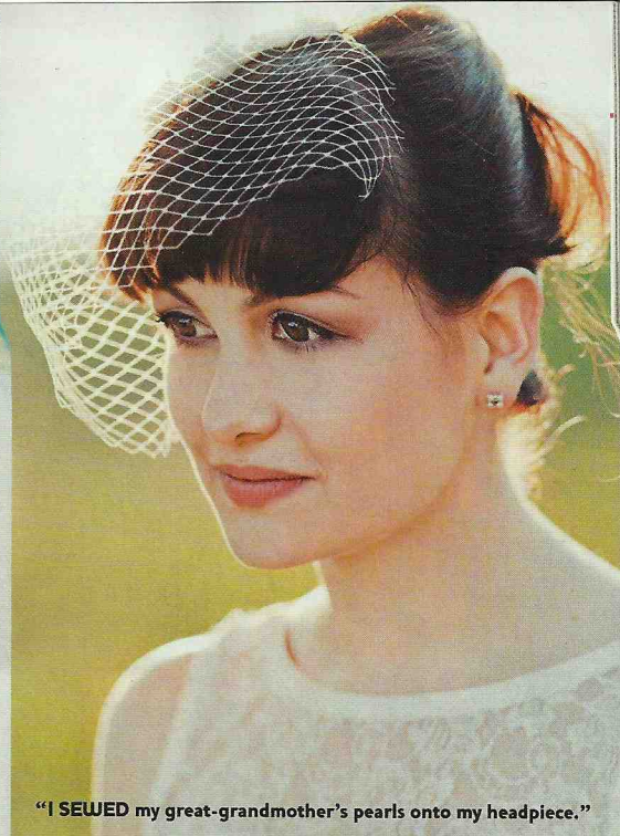
"I SEWED my great-grandmother's pearls onto my headpiece."